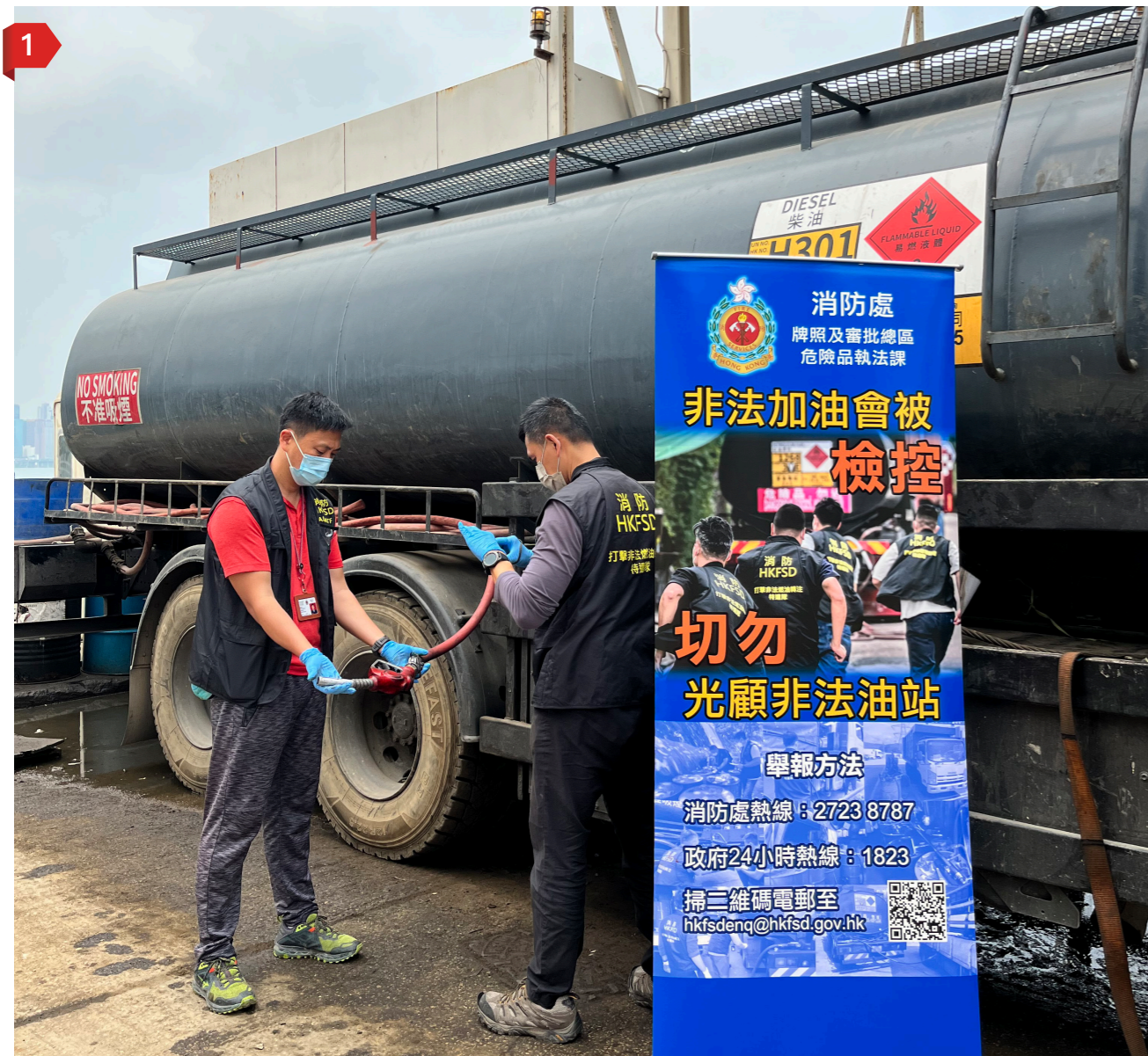
1 打擊非法燃油轉注特遣隊進行巡查及突擊行動，打擊非法燃油轉注活動。 The Anti-illicit Fuelling Activities Task Force cracks down on illicit fuelling activities by conducting inspections and surprise operations.

The Licensing and Certification Command formulates and enforces fire safety policies and regulations, and processes the registration of fire service installation (FSI) contractors. It also proactively steps up law enforcement actions against fire hazards on licensed/registered premises including restaurants, bars and karaoke establishments to enhance their fire safety.