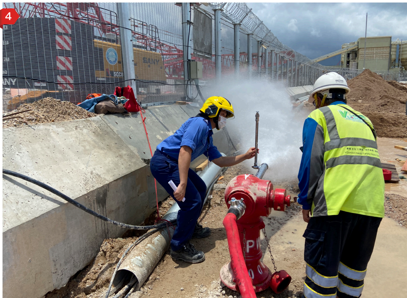
4 机场扩建工程课人员正验收三跑道系统的消防栓。 Airport Expansion Project Division personnel is conducting acceptance inspection for a street fire hydrant of the Three-Runway System.