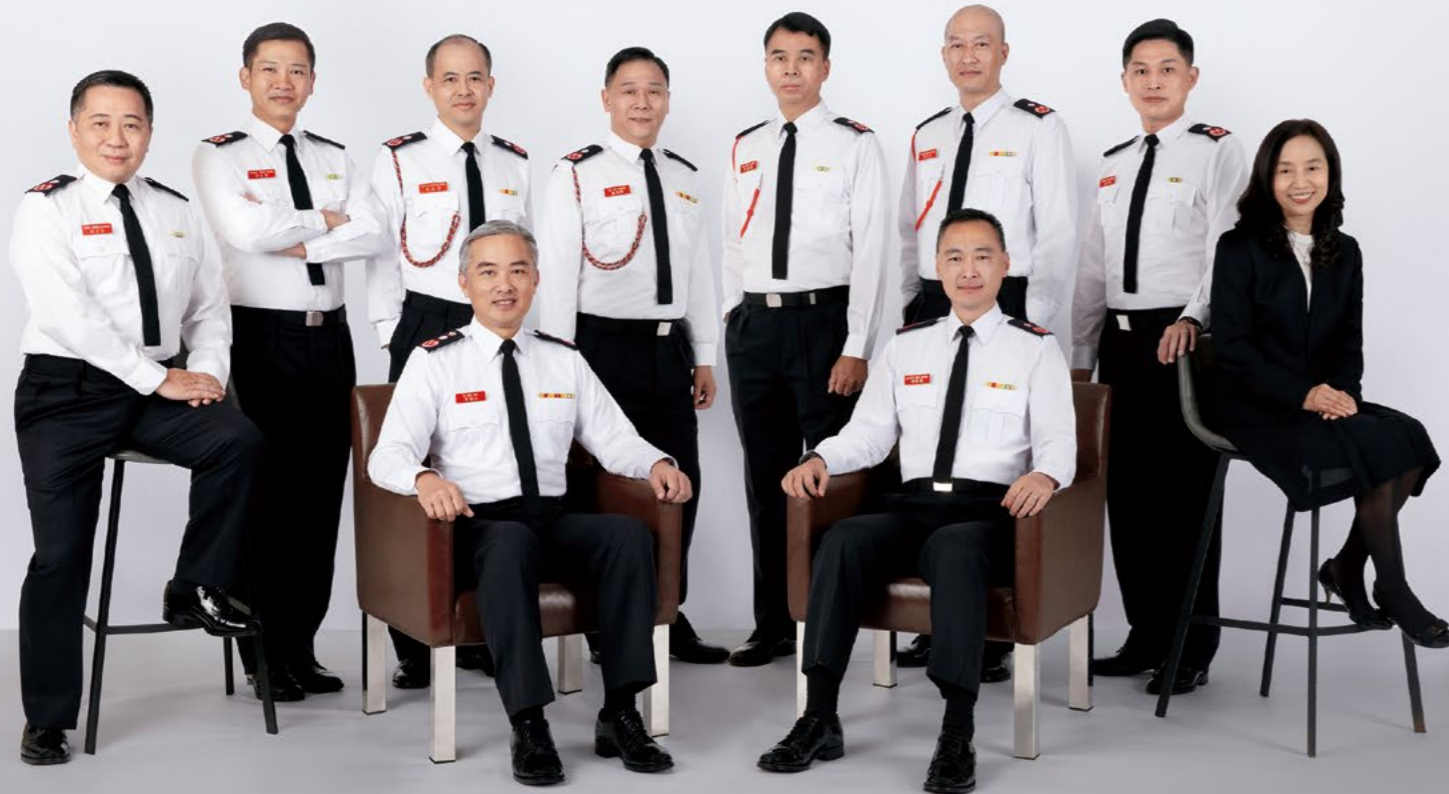
i. g. e. c. d. f. h. a. b. j.

消防处的主要职责包括扑灭火警；执行海陆救援工作；就防火事宜向市民提供意见；以及为伤病者提供紧急救护服务。消防处由消防处处长统领，共分为三个行动总区、两个防火总区，以及救护总区、总部总区和行政科。