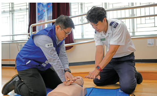
救護人員教授地區關愛隊隊員有關心肺復甦法。 Ambulance personnel teaches a district Care Team member about CPR.