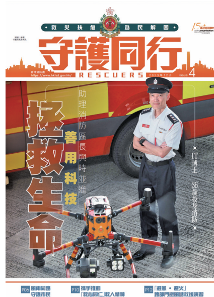
消防處刊物《守護同行》。 FSD's publication rescuers.

消防處於2018年推出宣傳角色「任何仁」，向公眾推廣「只要敢，就救到人」的信息。其諧音「任何人」，亦寓意「任何人都可以救人」。