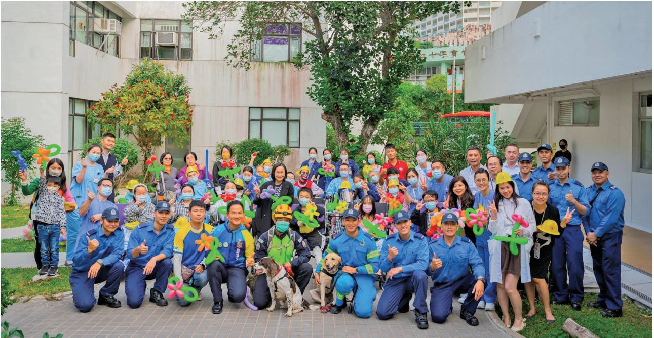
「消防安全大使計劃」活動。 Activity of The Fire Safety Ambassador Scheme.