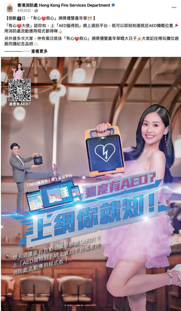
社交媒體宣傳：「有心救心」頒獎禮暨嘉年華。 Promotion through social media - Big Hearts, Save Hearts Awards Ceremony cum Carnival.