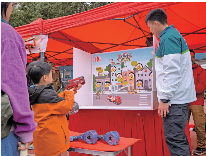
各區配合消防處冬季防火主題舉辦的活動。 Activities organised by various districts under the FSD's theme on fire safety during festive season.