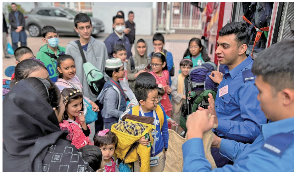
少數族裔青少年發展團隊活動。 Activities for the Ethnic Minority Youth Development Team.

The FSD, in collaboration with the Chinese University of Hong Kong and organisations including the Community Mental Health Association, initiated the PAP in 2012. The project targets junior secondary students who are in their critical development stage, and provides them with counselling, support and appropriate guidance.