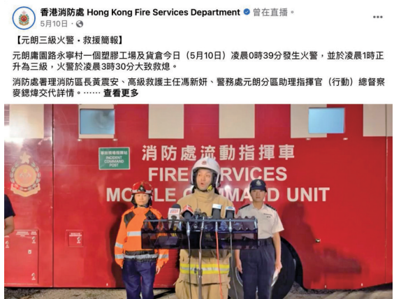
社交媒體發放：事故現場救援簡報。 Dissemination through social media: Incident press stand-up.