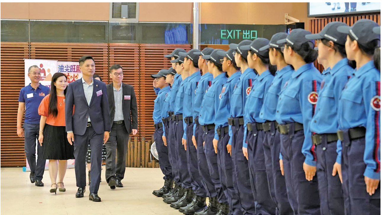
消防及救護青年團就職典禮。 FAST Connect Inauguration Ceremony.