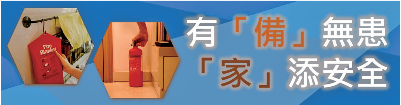
推廣家居手提滅火設備。 Promotion of portable firefighting equipment for use at domestic premises.