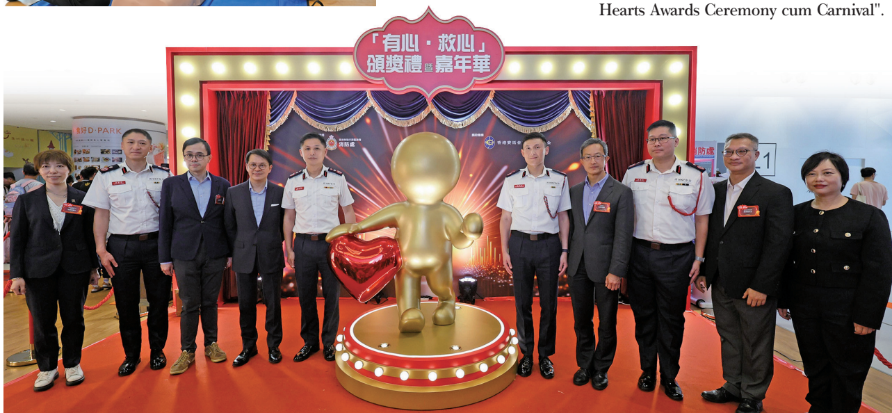
「有心·救心」頒獎禮暨嘉年華啓動禮。 Launching ceremony of "Big Hearts, Save Hearts Awards Ceremony cum Carnival".