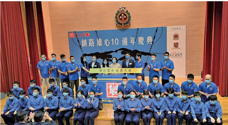
創路雄心計劃。 Path-finding Adventure Project.

「創路雄心」計劃創於2012年，以初中生為對象，由消防處與香港中文大學和社區精神健康促進會等機構合作，對在關鍵成長階段的學生予以匡導扶育，蒙以養正。