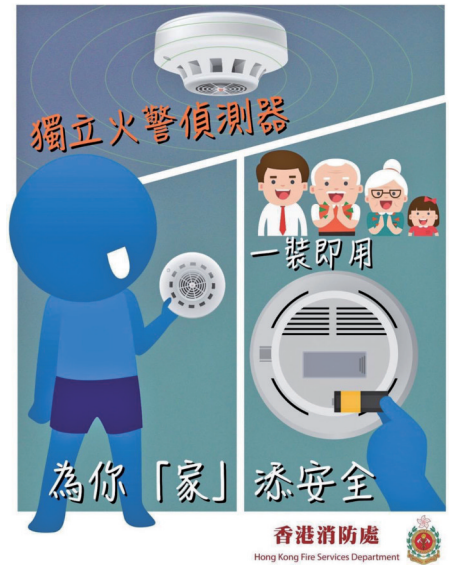
鼓勵在家安裝獨立火警偵測器。 Encouraging the installation of stand-alone fire detectors at home.