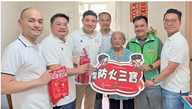
小心煮食爐火，慎防家居火警。 Use cooking stoves with care, beware of domestic fire.