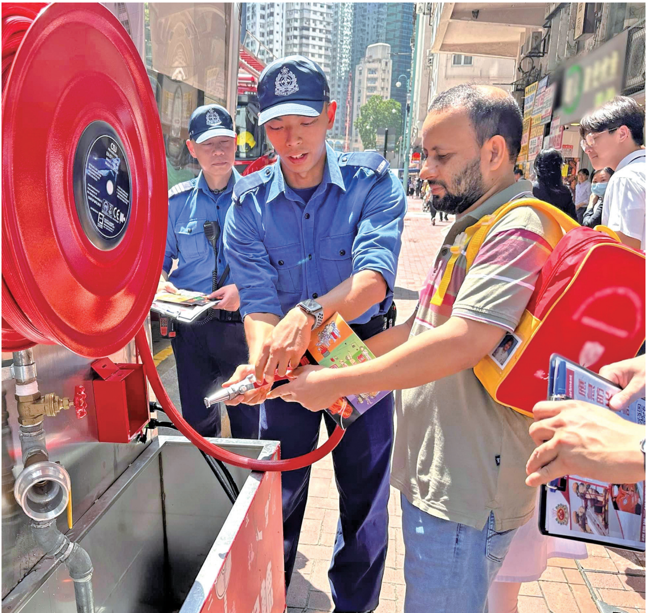
防火宣傳活動「打鐵趁熱」。 Hot Strike fire safety publicity campaign.

After a big fire or a fire that arouses public concern, the fire personnel from the relevant division will immediately produce a fire prevention publicity video and invite district organisations to jointly carry out publicity and education work on fire prevention in the district where the fire occurred while the fire is still fresh in their memory.